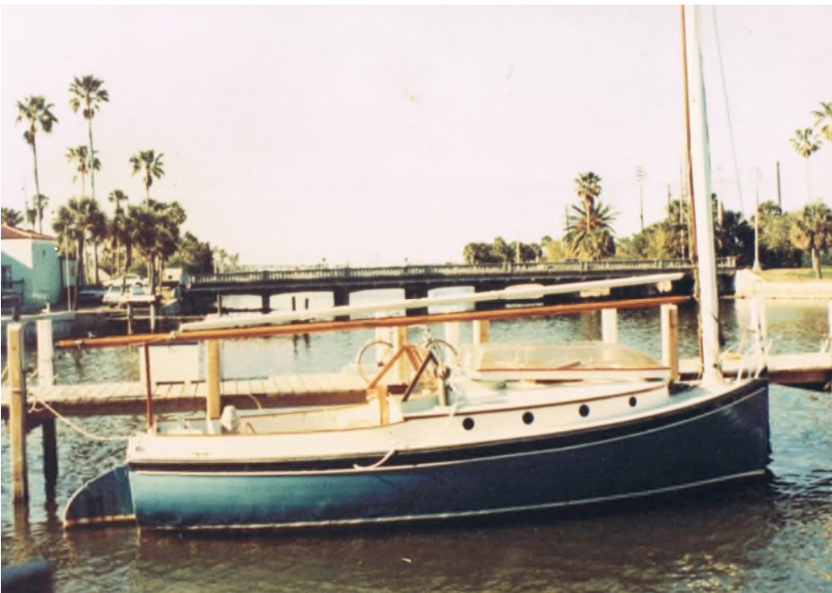
Florida, ca 1970